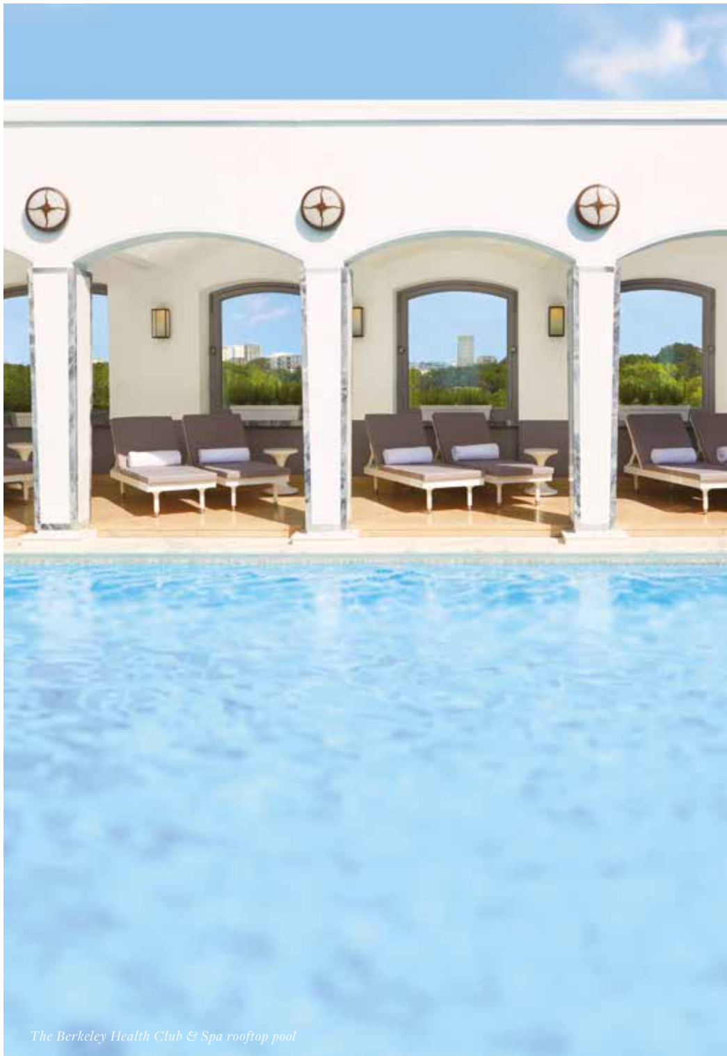
The Berkeley Health Club & Spa rooftop pool