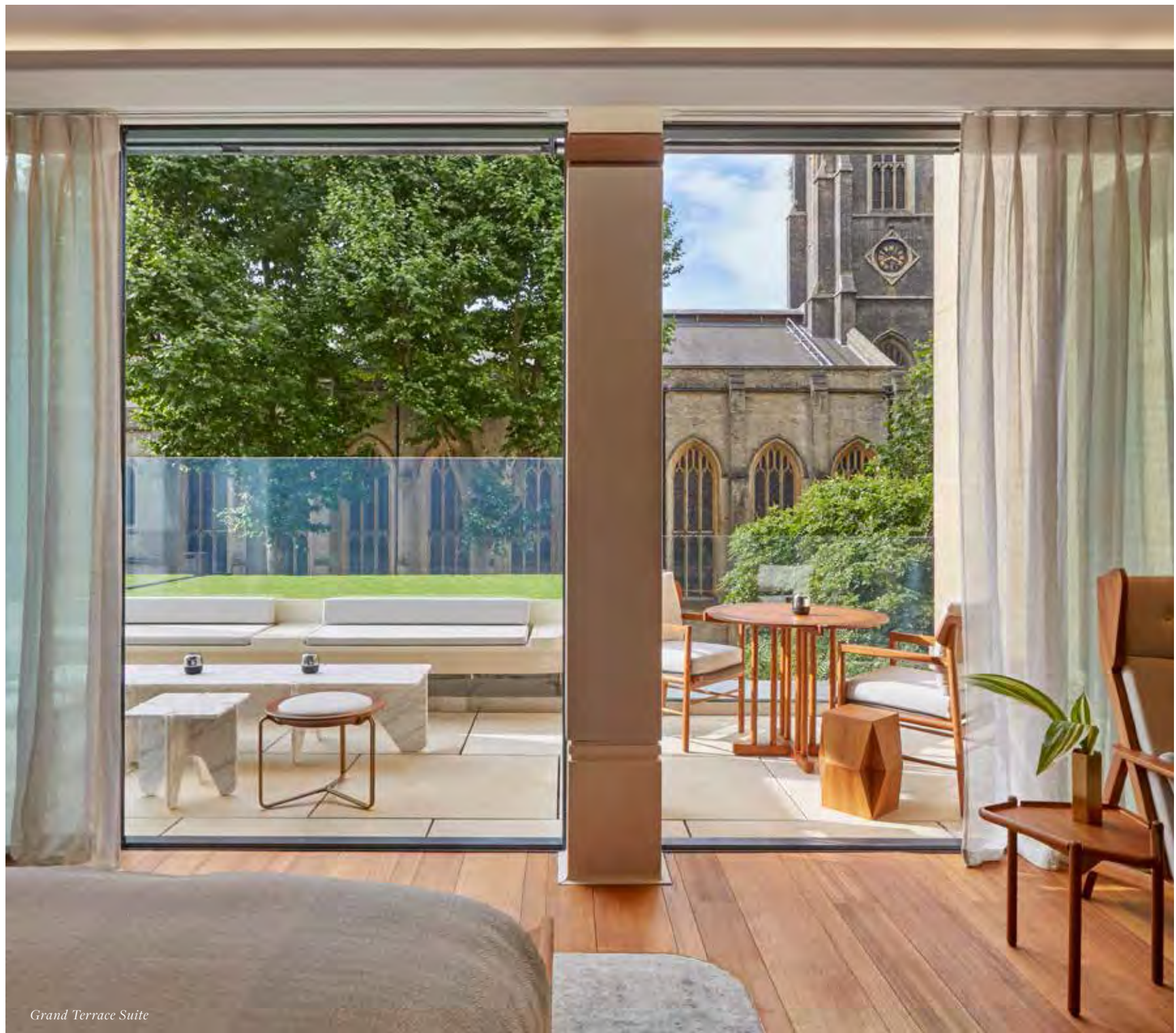
Grand Terrace Suite

Whether you're in London for a meeting of minds, to gather with the family for a special occasion, or just need space to unwind, each room and suite at The Berkeley offers a refuge from the rush of the city from the moment you arrive. Each, individually designed, is a study in urbane comfort with simple, beautiful details effortlessly combined. Handpicked furniture, luxurious fabrics, bathrooms of Italian marble and original artworks abound.