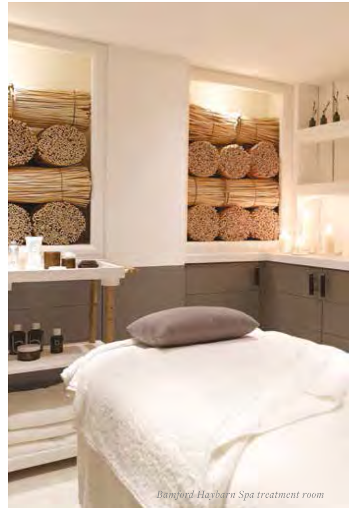
Bamford Haybarn Spa treatment room

Whatever the weather, a slice of the countryside sits high above the bustle of Knightsbridge. Take a dip in the rooftop pool, squirrel yourself away in the secret garden, or gaze across the green acres of Hyde Park. A retractable roof keeps the warmth in, and the weather out. Inside, you can enjoy the soothing tranquility of the Bamford Haybarn Spa, brought specially to The Berkeley for its natural and organic treatments. It's a truly special place to relax and rejuvenate with packages to suit women of influence and men on a mission.