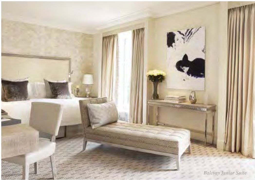
Balcony Junior Suite